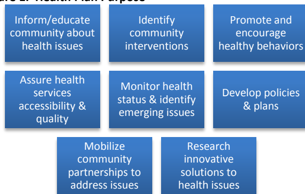
Figure 1. Health Plan Purpose

The Health Plan covers a vast spectrum of topics, from labor force statistics to immunization rates, reflecting the broad scope of issues affecting public health as well as highlighting the correlation between socioeconomics and community health. For example, education is a socioeconomic factor that can significantly impact the individual and community health. Figure 2 and Figure 3 elaborate on the relationships between health and socioeconomic factors.