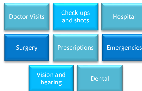
Figure 2. Florida KidCare Covered Services